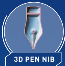
3D PEN NIB